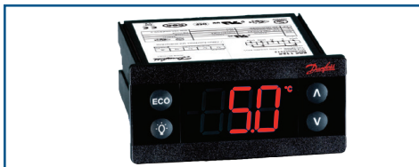
Digital Temperature Controller