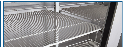
Electrostatically painted Shelves