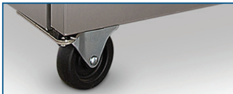
Heavy Duty Casters